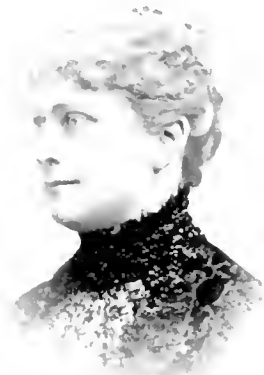
ANNA LIVINGSTON STREET MORTON.